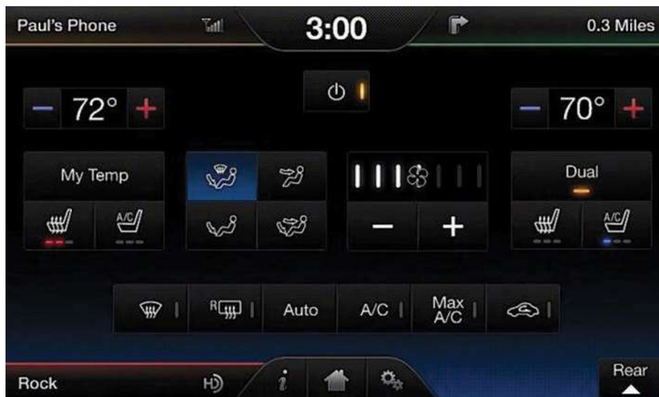
Fig. 1 Infotainment system of a car