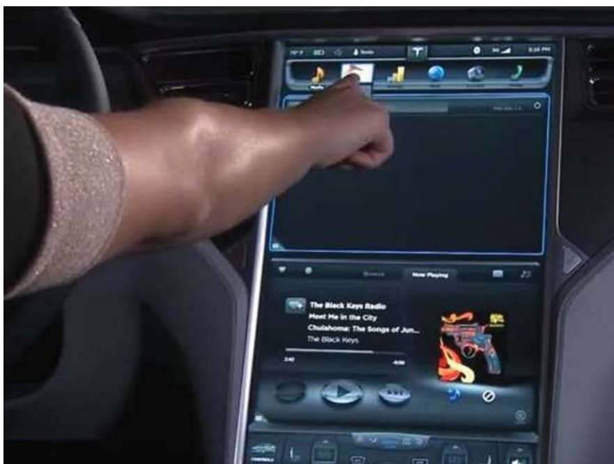
Fig. 2 Infotainment of a car with autonomous systems

http://static4.businessinsider.com/image/528a898eeab8eafb4621ed51-960/infotainment-system.png