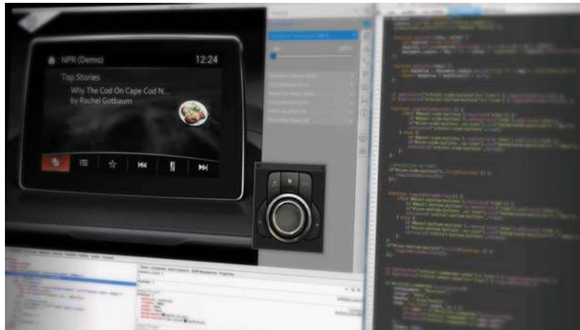
Fig. 3 Open Car SDK

http://www.mazda3hacks.com/doku.php?id=apps:opencar